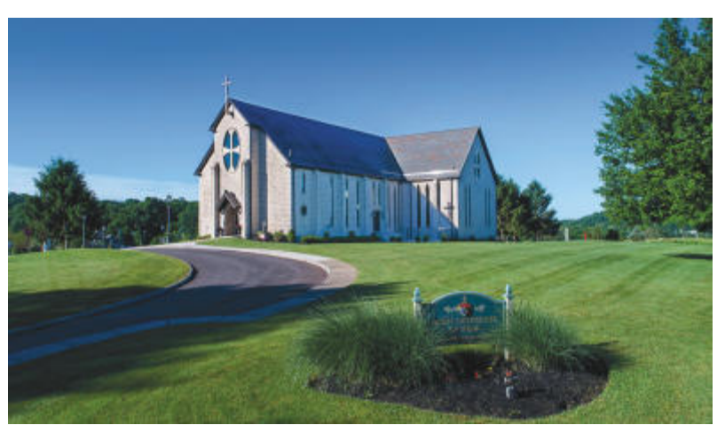
January 24, 2021