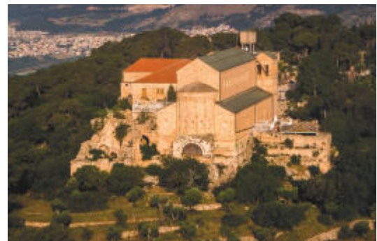
Church of the Transfiguration on Mount Tabor, Israel