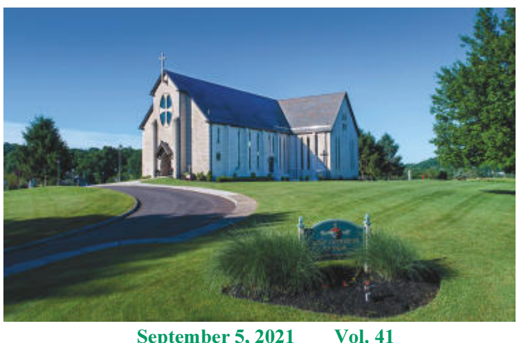
September 5, 2021