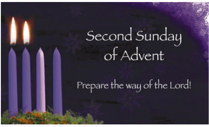
December 4, 2022