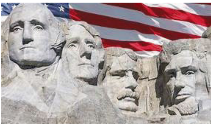
February 16, 2025