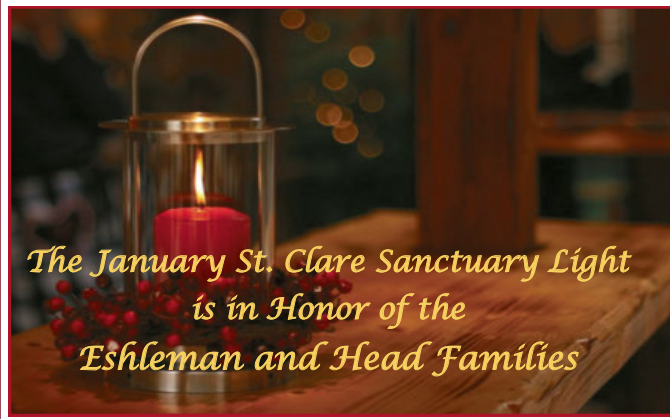
The January St. Clare Sanctuary Light is in Honor of the Eshleman and Head Families

Call St. Clare to add a friend, loved one or yourself to our Prayer Square