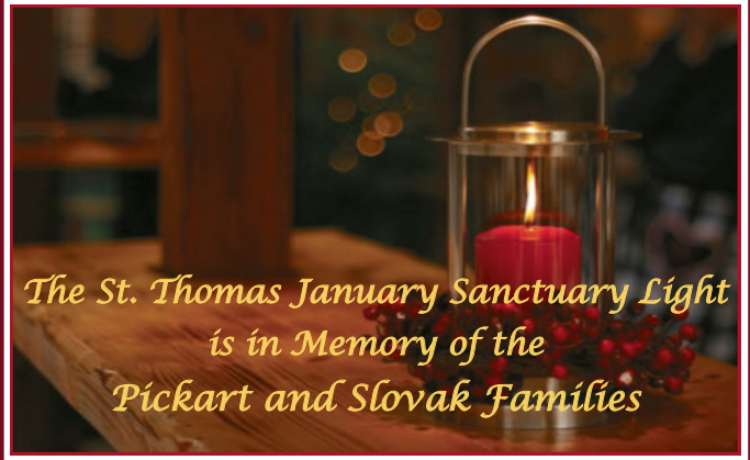
The St. Thomas January Sanctuary Light is in Memory of the Pickart and Slovak Families