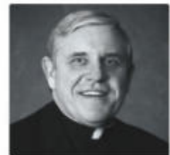
Archbishop Jerome ListECKI