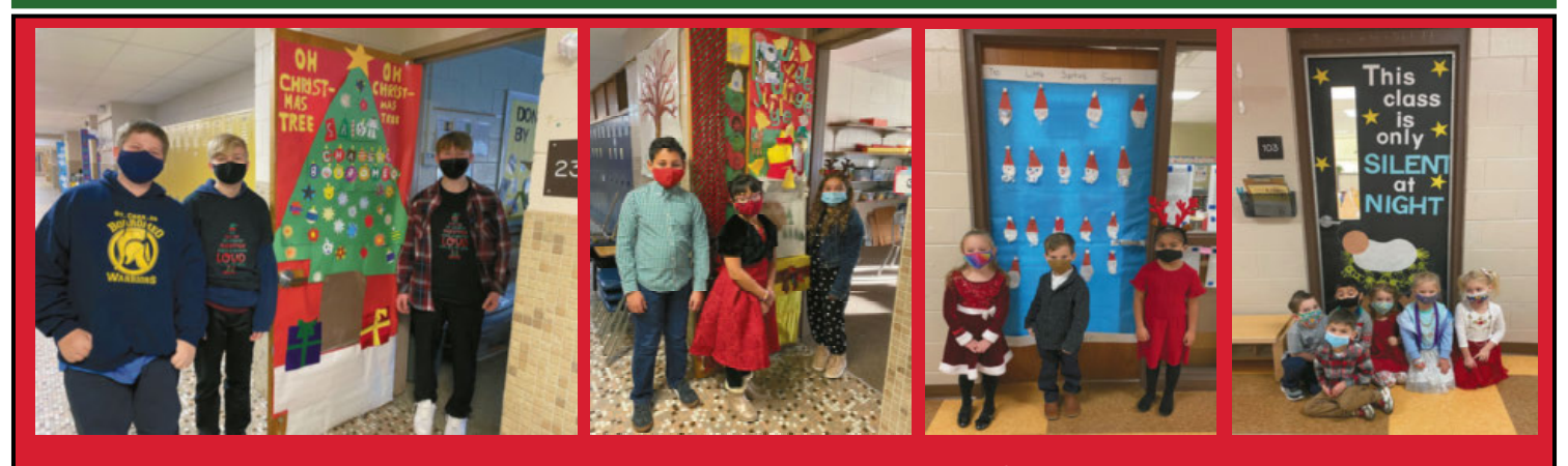
St. Charles Borromeo School students decorated their doors for the Christmas season. Here are a few of their festive creations.

Your generosity every year helps to make Christmas joyful for so many!