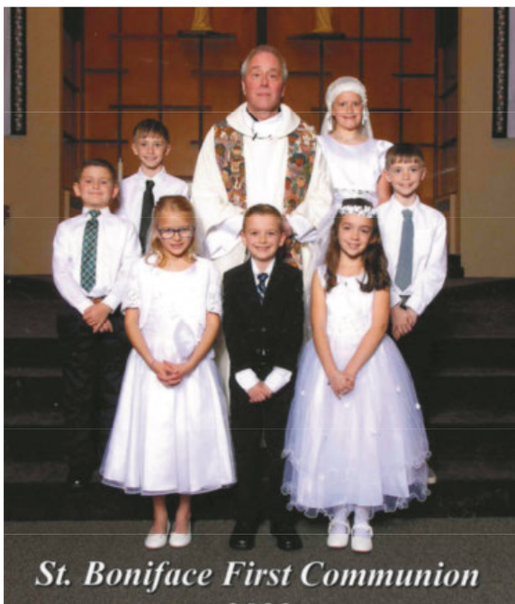
St. Boniface First Communion 2022