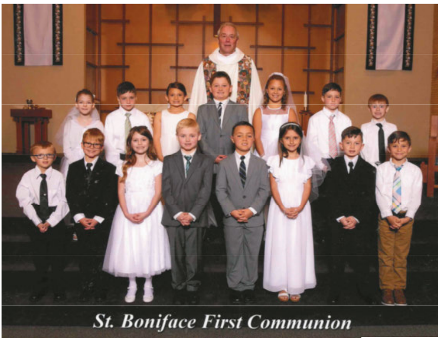
St. Boniface First Communion 2022