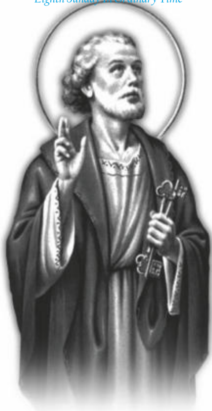
ST. PETER APOSTLE Pray For Us

RECTORY PHONE 260-744-2765 RECTORY FAX 260-744-1972 EMAIL: stpeter1872@frontier.com ONLINE GIVING: www.osvonlinegiving.com/4210