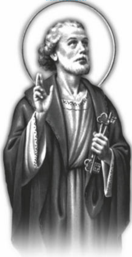
ST. PETER APOSTLE Pray For Us

RECTORY PHONE 260-744-2765 RECTORY FAX 260-744-1972 EMAIL: stpeter1872@frontier.com ONLINE GIVING: www.osvonlinegiving.com/4210