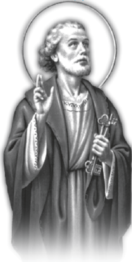
ST. PETER APOSTLE Pray For Us

RECTORY PHONE 260-744-2765 RECTORY FAX 260-744-1972 EMAIL: stpeter1872@frontier.com ONLINE GIVING: www.osvonlinegiving.com/4210