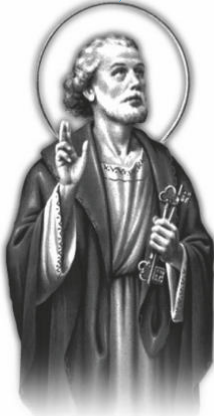
ST. PETER APOSTLE Pray For Us

RECTORY PHONE 260-744-2765 RECTORY FAX 260-744-1972 EMAIL: stpeter1872@frontier.com ONLINE GIVING: www.osvonlinegiving.com/4210