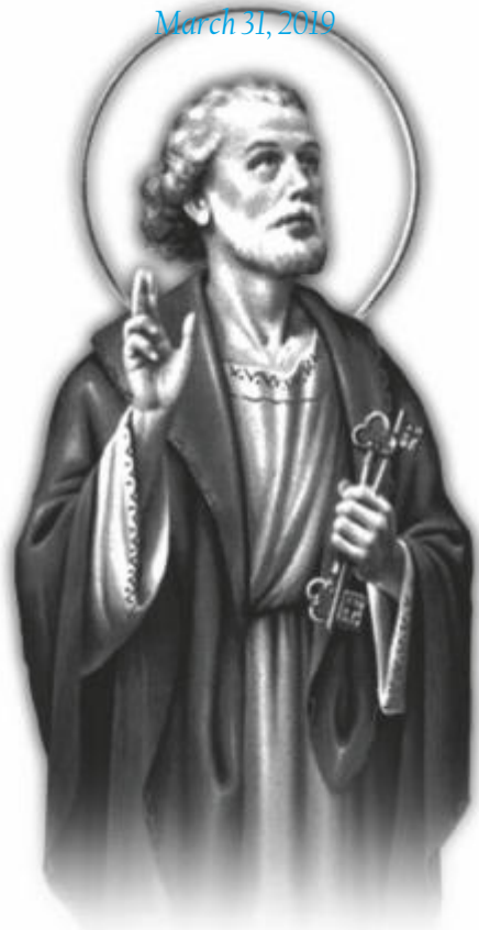
ST. PETER APOSTLE Pray For Us

RECTORY PHONE 260-744-2765 RECTORY FAX 260-744-1972 EMAIL: stpeter1872@frontier.com ONLINE GIVING: www.osvonlinegiving.com/4210