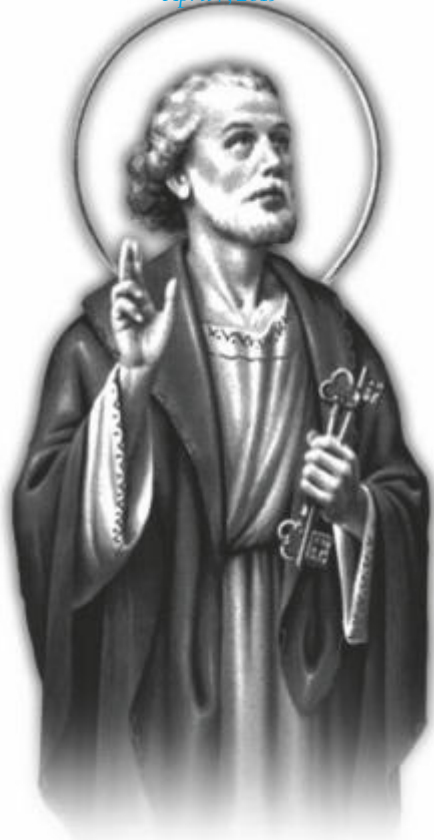
ST. PETER APOSTLE Pray For Us

RECTORY PHONE 260-744-2765 RECTORY FAX 260-744-1972 EMAIL: stpeter1872@frontier.com ONLINE GIVING: www.osvonlinegiving.com/4210