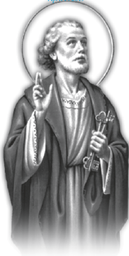
ST. PETER APOSTLE Pray For Us

RECTORY PHONE 260-744-2765 RECTORY FAX 260-744-1972 EMAIL: stpeter1872@frontier.com ONLINE GIVING: www.osvonlinegiving.com/4210