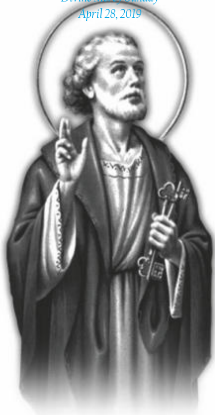
ST. PETER APOSTLE Pray For Us

Second Sunday of Easter Divine Mercy Sunday April 28, 2019