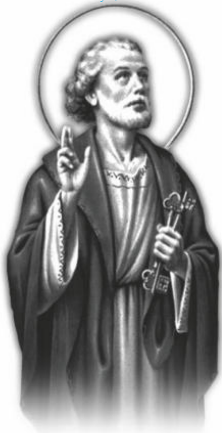
ST. PETER APOSTLE Pray For Us

RECTORY PHONE 260-744-2765 RECTORY FAX 260-744-1972 EMAIL: stpeter1872@frontier.com ONLINE GIVING: www.osvonlinegiving.com/4210