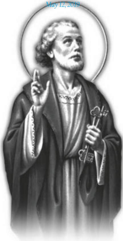
ST. PETER APOSTLE Pray For Us

RECTORY PHONE 260-744-2765 RECTORY FAX 260-744-1972 EMAIL: stpeter1872@frontier.com ONLINE GIVING: www.osvonlinegiving.com/4210