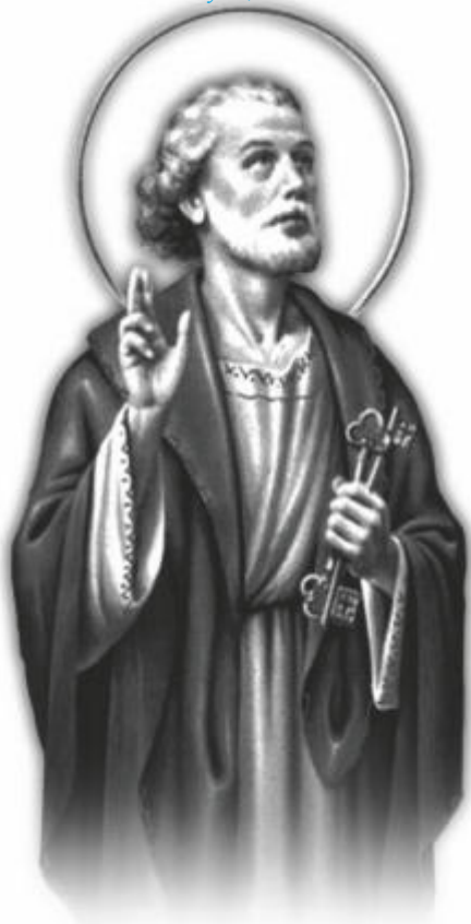
ST. PETER APOSTLE Pray For Us

RECTORY PHONE 260-744-2765 RECTORY FAX 260-744-1972 EMAIL: stpeter1872@frontier.com ONLINE GIVING: www.osvonlinegiving.com/4210