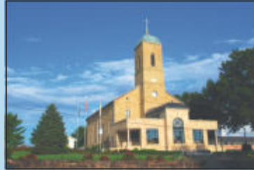
St. Anthony of Padua St. Anthony, IN