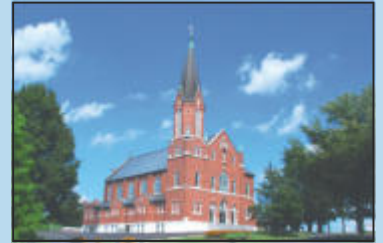
Sacred Heart of Jesus Schnellville, IN