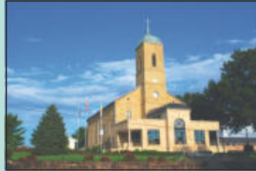
St. Anthony of Padua St. Anthony, IN