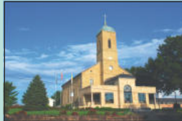
St. Anthony of Padua St. Anthony, IN