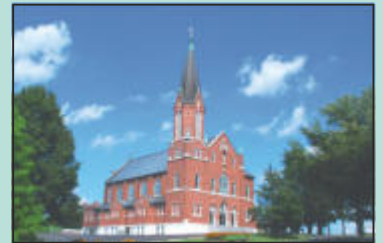
Sacred Heart of Jesus Schnellville, IN