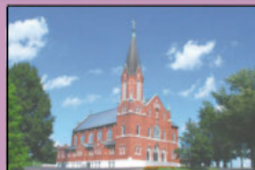
Sacred Heart of Jesus Schnellville, IN