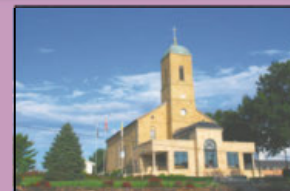
St. Anthony of Padua St. Anthony, IN