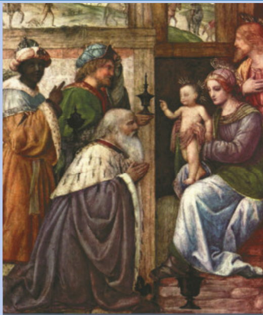
THE EPIPHANY of the Lord