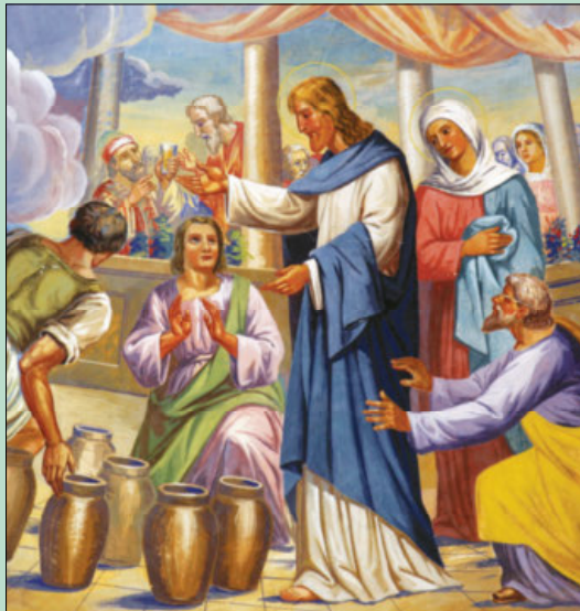
The Wedding at Cana in Galilee