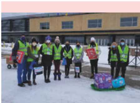
▲ Thanks to this group of SMG freshman and young adults who volunteered at the March for Life Rally in Madison on January 2.