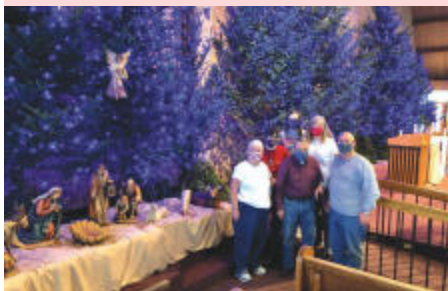
▲ Thanks to all the volunteers who worked diligently to decorate and prepare our church for the Christmas season.