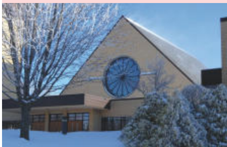
▲ In December and January, we had a number of days that our parish landscape and grounds were covered with beautiful frost.