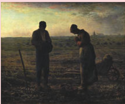
"Angelus," by Jean François Millet

So next time you can't think of what to get that person who has everything, needs nothing or is just hard to buy for, consider requesting a Mass for them. Having a Mass said for someone, whether living or deceased, brings the spiritual graces to them and thus is a fabulous gift.