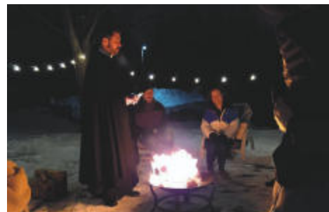
▲ Young adults enjoy fellowship at the monthly Cor ad Cor event.

My SEEK21 takeaway has been thanksgiving – gratitude for an engaging recharge of my faith with talks from priests, religious, and laypeople, as well as for having the SMG Young Adults group members by my side lifting our eyes to Heaven together.