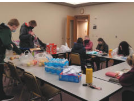
▲ Youth completed a service project making packages to give out to the homeless people they encounter.