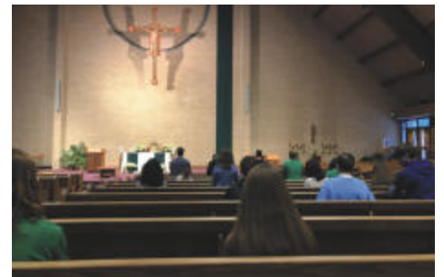
▲ Following talks and activities, the youth attended Mass together.

One of the best things about Frassati Fest is that it is an event for high schoolers that is planned by high schoolers. The Frassati Fest Planning Team met monthly with Diocesan staff. They started in August to prepare for the event and even met a few times afterwards to reflect on and celebrate the awesome event. Through the Planning Team, high schoolers have made lifelong friendships and had an absolute blast. Each month, they spend time intentionally getting to know each other better, growing closer to God,