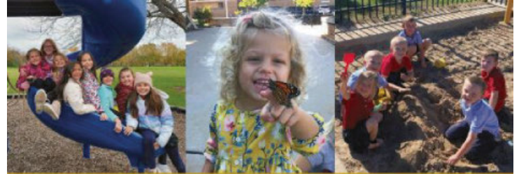
TOUR OUR SCHOOL | MEET OUR TEACHERS | MEET OUR FAMILIES | EXPERIENCE OUR COMMUNITY

Remember, you can donate gift cards through our SCRIP program too (contact marenkleinmann@gmail.com ). We appreciate your consideration and generosity! Contact Kara Cartledge with any questions, auction@stmaryeg.org .