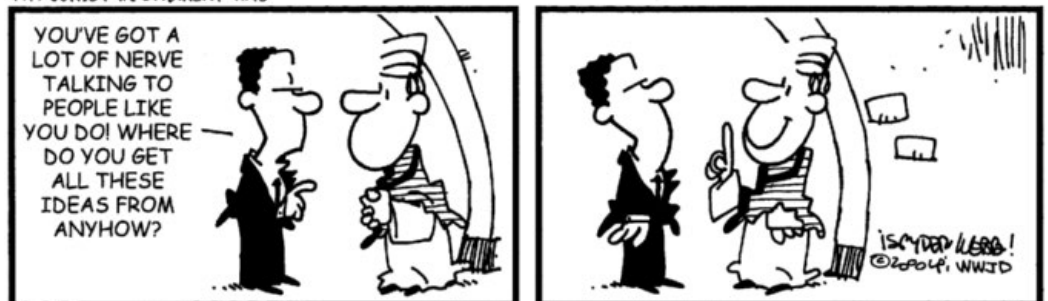
4TH SUNDAY IN ORDINARY TIME

The Diocese of Superior contains fourteen Catholic elementary schools serving 1643 students, 3 years of age through eighth grade, and ministers to 1108 families. The second collection this weekend is to provide additional and immediate assistance to those Catholic Schools and their students. January Offering Envelope packets have a special envelope or you can make a tax-deductible donation to the Catholic Schools Fund via the giving link on our parish website www.holyfamilywoodruff.org and MyParish App. Thank you for your support and generosity!