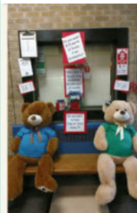
Winners Received: Mega Teddy Bears Principal for the day Pet Panther Day

Our favorite YCLH Events & Incentives Over the years!!