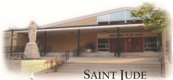
SAINT JUDE 1420 Division Street Green Bay, WI 54303