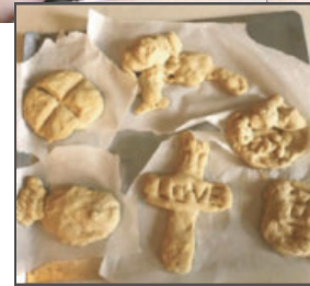
On Saturday, April 9th 2nd graders spent the morning on retreat preparing for their 1st Holy Communion Day.