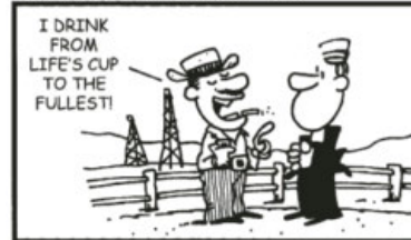
18TH SUNDAY IN ORDINARY TIME