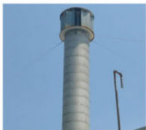
OLD BOILER SMOKE STACK