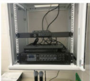
NEW TECHNOLOGY IN PC