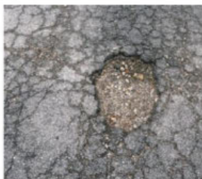
OLD PARKING LOT CRACKS