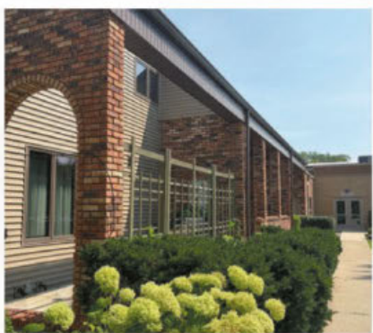
EXTERIOR SIDING AFTER