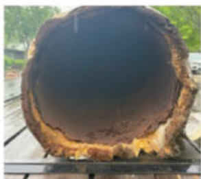
OLD BOILER PARTS