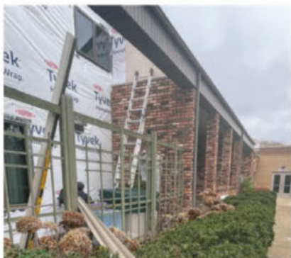
EXTERIOR SIDING BEFORE