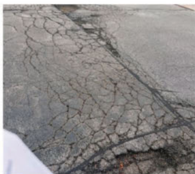
OLD PARKING LOT CRACKS