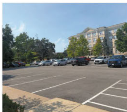
NEW PARKING LOT