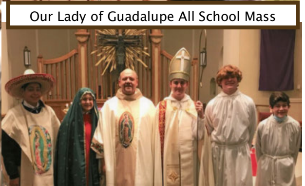
Our Lady of Guadalupe All School Mass