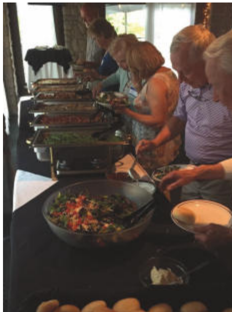
Couples' Night Out - Monday, Nov. 5 Beach House Restaurant 2301 S Lake Shore Dr in Decatur

Couples of all ages from all area parishes are invited to this fun evening at the Beach House on Monday, November 5 at 6:30pm. A light dinner will be provided, and you'll create friendships with married Catholic couples in the Decatur area. The event costs $30 per couple, and a cash bar is available. To make a reservation, please leave a message at (217) 422-4534 or register online at decaturcouplesnight.out.rsvpify.com