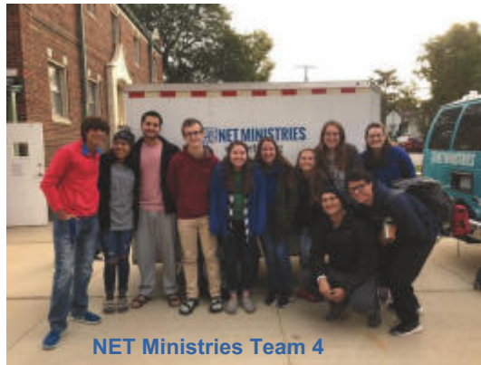
NET Ministries Team 4