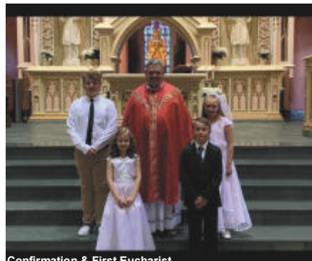
Confirmation & First Eucharist