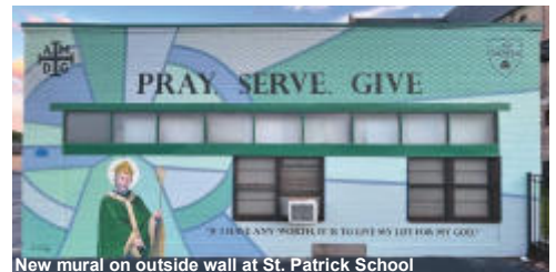
New mural on outside wall at St. Patrick School