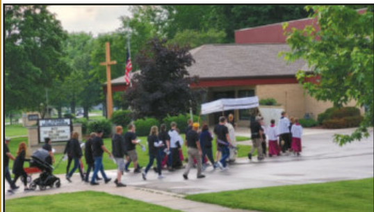
End of Procession