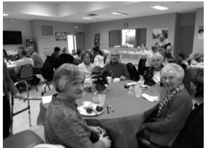
Wonderful Parish Christmas Party – great fellowship and food.