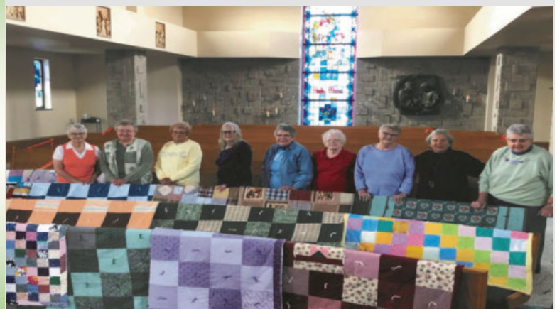
Shepherd of the Hills Catholic Parish quilters donated eight beautiful quilts to Sleep in Heavenly Peace, an organization that builds and delivers beds to children in need of a bed and a safe place to sleep in Fond du Lac County