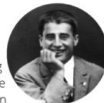
Bl. Pier Giorgio Frassati

For more information visit: blessedsacramentteens.org/FrassatiFest