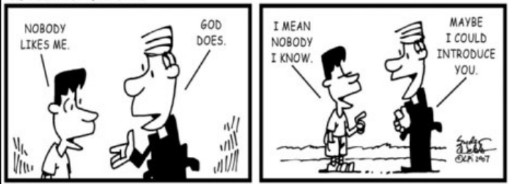
2ND SUNDAY IN ORDINARY TIME

The Durand Area Food Pantry will be open for food box pick-up on the 4th Wednesday of each month from 4:30-6 p.m. and on the 4th Saturday from 9-10:30 a.m. at Trinity Lutheran in Durand.