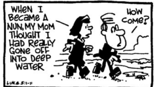
5 th SUNDAY IN ORDINARY TIME

When we encounter or even ponder God’s magnificence, power, and awesomeness, we easily begin to feel our own smallness and perceived insignificance. After all, who can compete with eternal greatness, seraphim, or the ability to catch great numbers of fish? We unfortunately think that God’s presence somehow overrides us, reduces our importance, and only seeks to judge our inadequacies and doubts. Things begin to change a bit when we realize that what we may have seen as overwhelming and frightening is really only unconditional, unmerited love. Love has tremendous majesty and power. When we listen to this power and stop seeing it as threatening or dooming, our fear dissipates and Divine friendship takes root. Remaining close to what we once preferred at a distance, we can journey to places we never thought possible and do things we never thought we could do. Strengthened by Divine friendship and encouraged by its life-giving power, we can say “here I am, send me!” when God asks, “whom shall I send?” Sin and fear no longer are of concern to the one who remains close to God in a bond of trust.