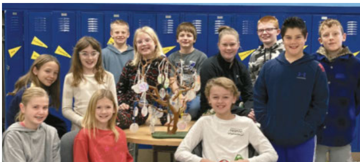
Jesse Tree—Room 6C

Bake Sale —Grade 4 students will host the next bake sale on January 18, 2023 in the Sister Ethelbert Center. Each student will be asked to bring items to be sold. Proceeds go to the Missions in Africa.