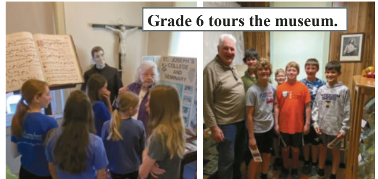
Grade 6 tours the museum.

You are invited to a historical diocesan-wide celebration at the BOS Center in Springfield – To celebrate the Diocesan Year of the Eucharist and the 100 th anniversary of the transfer of the See city from Alton to Springfield, the Eucharistic Congress is taking place Saturday, October 28 at the BOS Center in Springfield. This dynamic experience will include nationally recognized Catholic speakers, adoration, confession, and Mass. The arena will be packed with thousands of Catholics from across the diocese. To attend, contact the parish office as each parish in the diocese is given a specific number of available seats. You can inquire about reserving a seat through the parish office starting July 1, or if you are interested in volunteering, you can register now! For more information on the event or volunteering or financially supporting/sponsoring the event, visit dio.org .