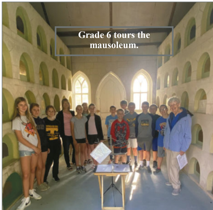
Grade 6 tours the mausoleum.