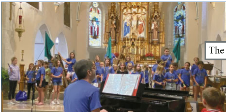
The choir performed their “Three Trees” play for grades 1-6.

God is the mighty light His Son named Jesus was always right He was kind and caring I can be that too, by sharing When I share, I know people will care I can make God’s light By doing what is good and right