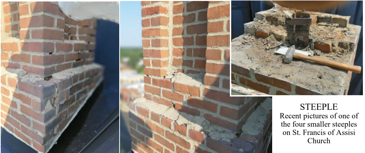
STEEPLE Recent pictures of one of the four smaller steeples on St. Francis of Assisi Church

I have been receiving favorable comments from you about the new kneelers. It was time to replace the old ones, and we will have these new ones for many years.