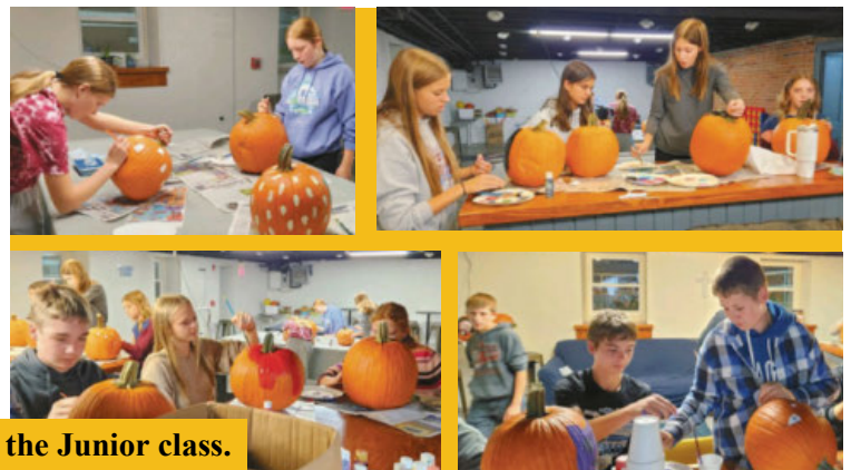
Freshman painting the pumpkins that were passed out by the Junior class.