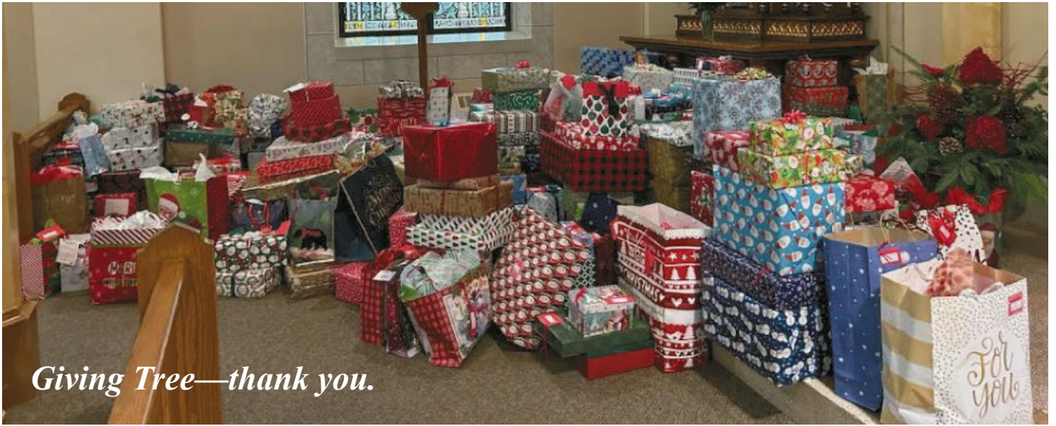
Giving Tree—thank you.