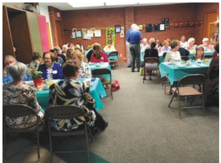
Great turnout for the annual Women's Club Breakfast held June 2, 2019.

Pentecost: Feast of Unity, Understanding, and Sharing; "On that morning, fifty days after Easter, a powerful wind blew over Jerusalem and the flame of the Holy Spirit descended on the gathered disciples. It came to rest upon the head of each of them and ignited in them a divine fire, a fire of love, capable of transforming things. Their fear disappeared, their hearts were filled with new strength, their tongues were loosened and they began to speak freely, in such a way that everyone could understand the news that Jesus Christ had died and was risen. On Pentecost, where there was division and incomprehension, unity and understanding were born." (Pope Benedict XVI, Pentecost 2012) Learn, Act, Connect, Pray: Call upon the power of the Holy Spirit to empower us to spread unity in a divided and intolerant world and share our resources with those who have-not. Holy Spirit, may we respect all life because You, God, are the Source of Life.