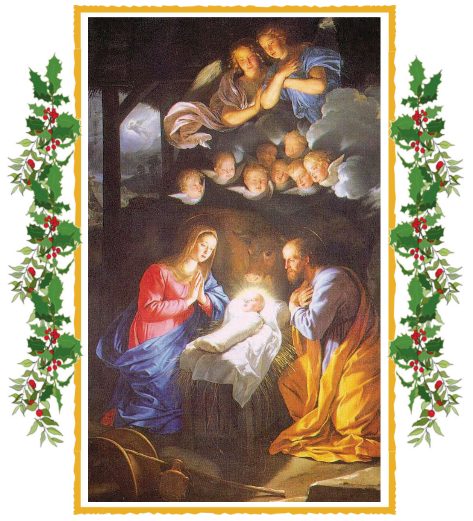
THE HOLY FAMILY OF JESUS, MARY AND JOSEPH DECEMBER 26, 2021

2438 Atwood Ave. | Madison, WI | (608) 249-9256